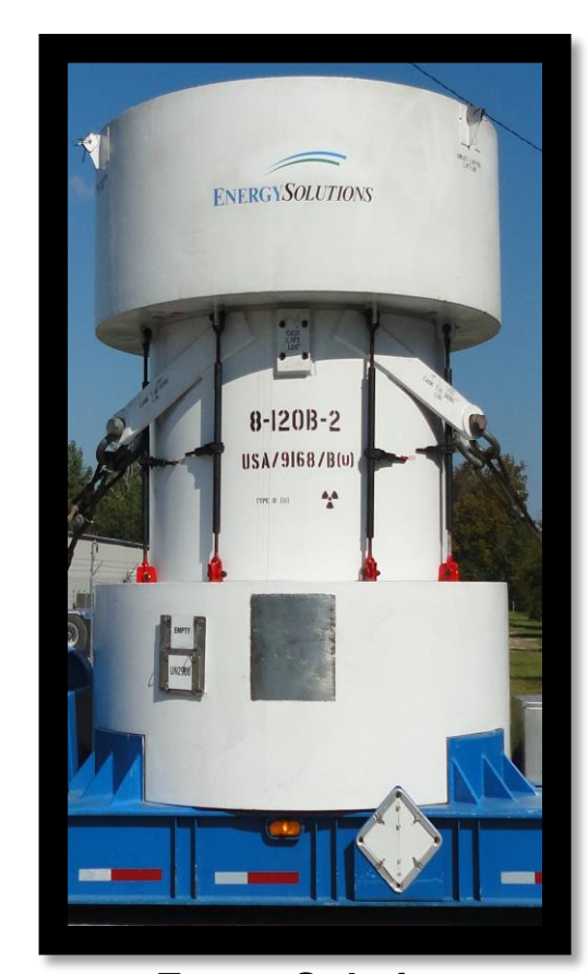
EnergySolutions maintains the largest fleet of licensed shipping casks in the country!