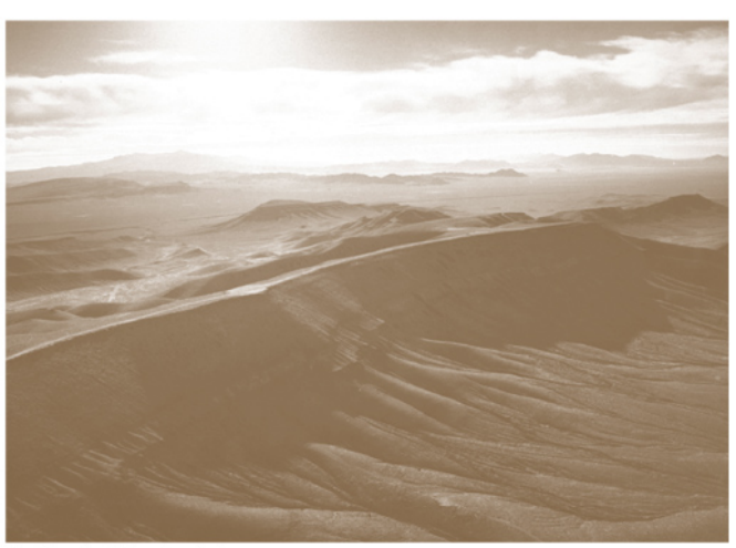
View of Yucca Mountain from the northwest