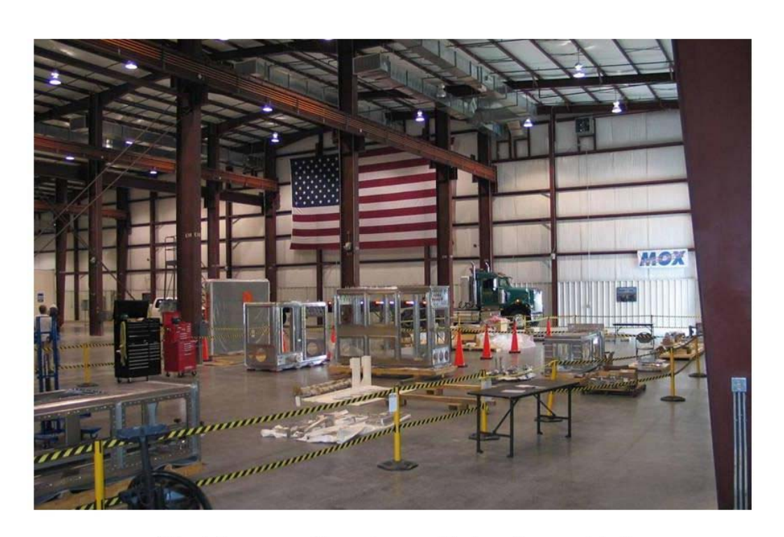
First Process Gloveboxes Being Assembled

Long Lead process tanks and equipment continue to be delivered to SRS. First process glove boxes delivered and being assembled in the PAF