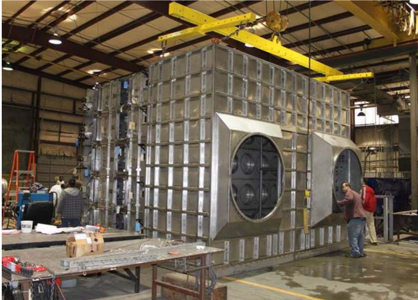
Ventilation HEPA Filter Housing at Vendor