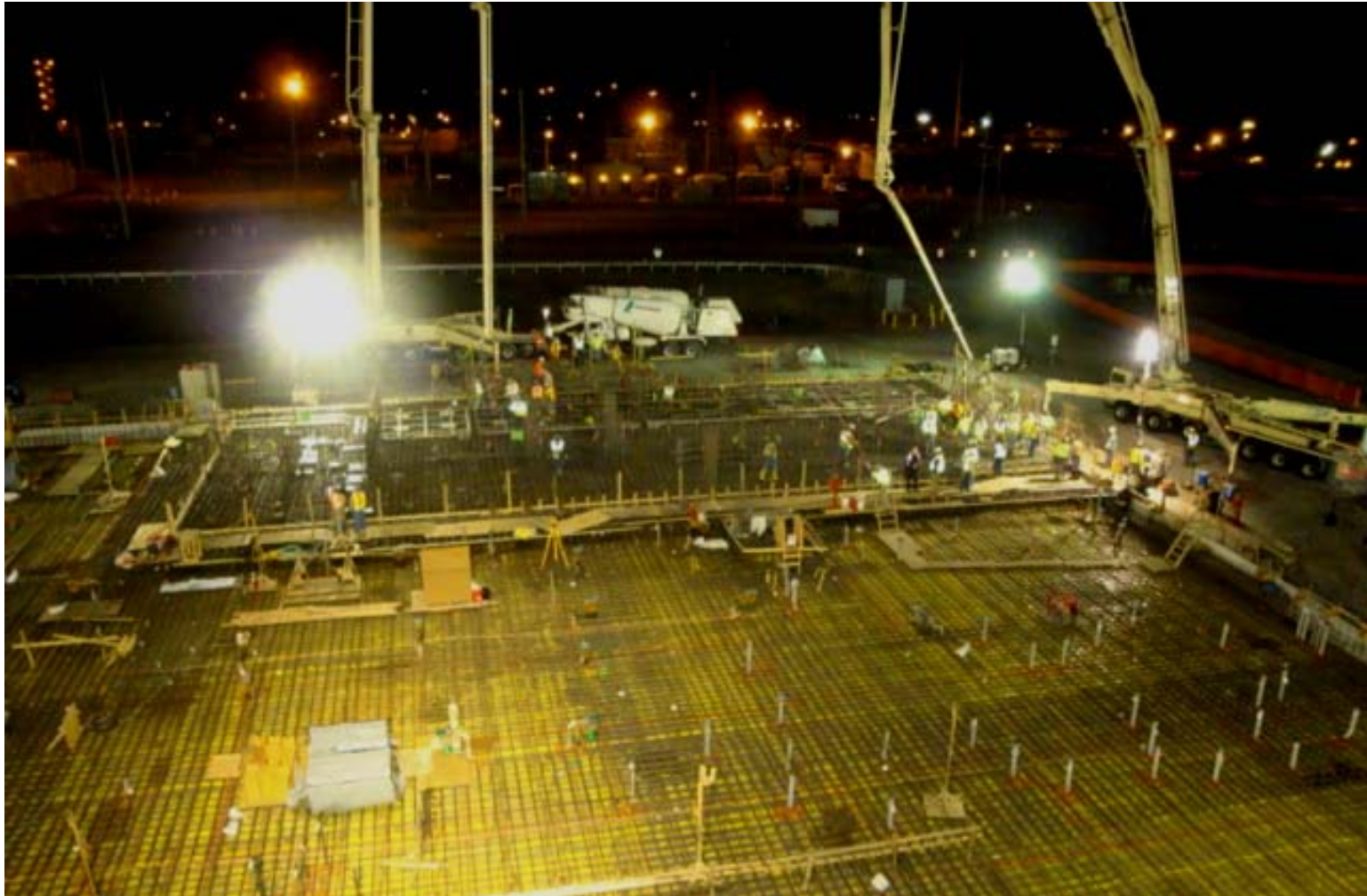
First Basemat Placement