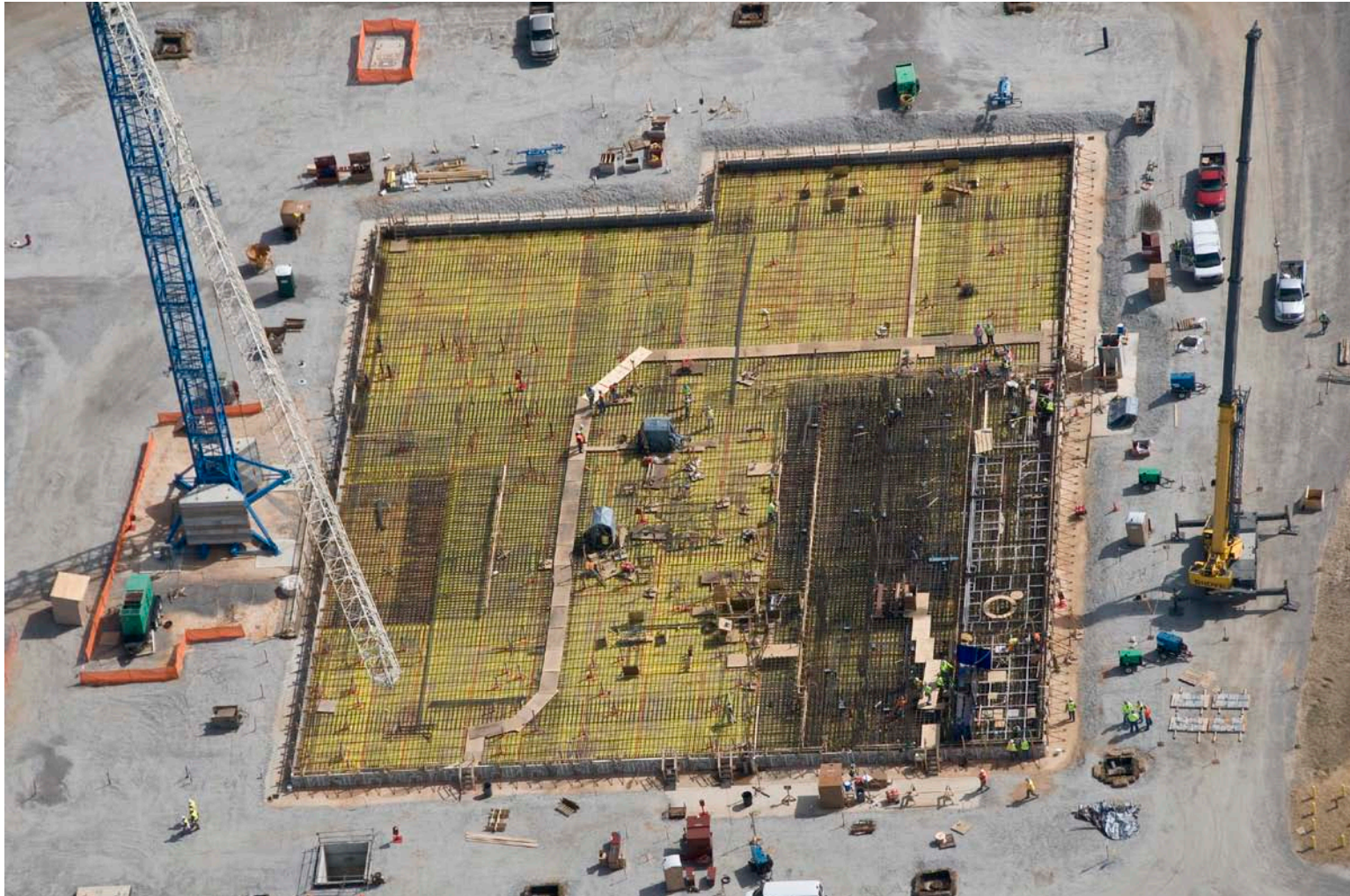
WSB, March 2010