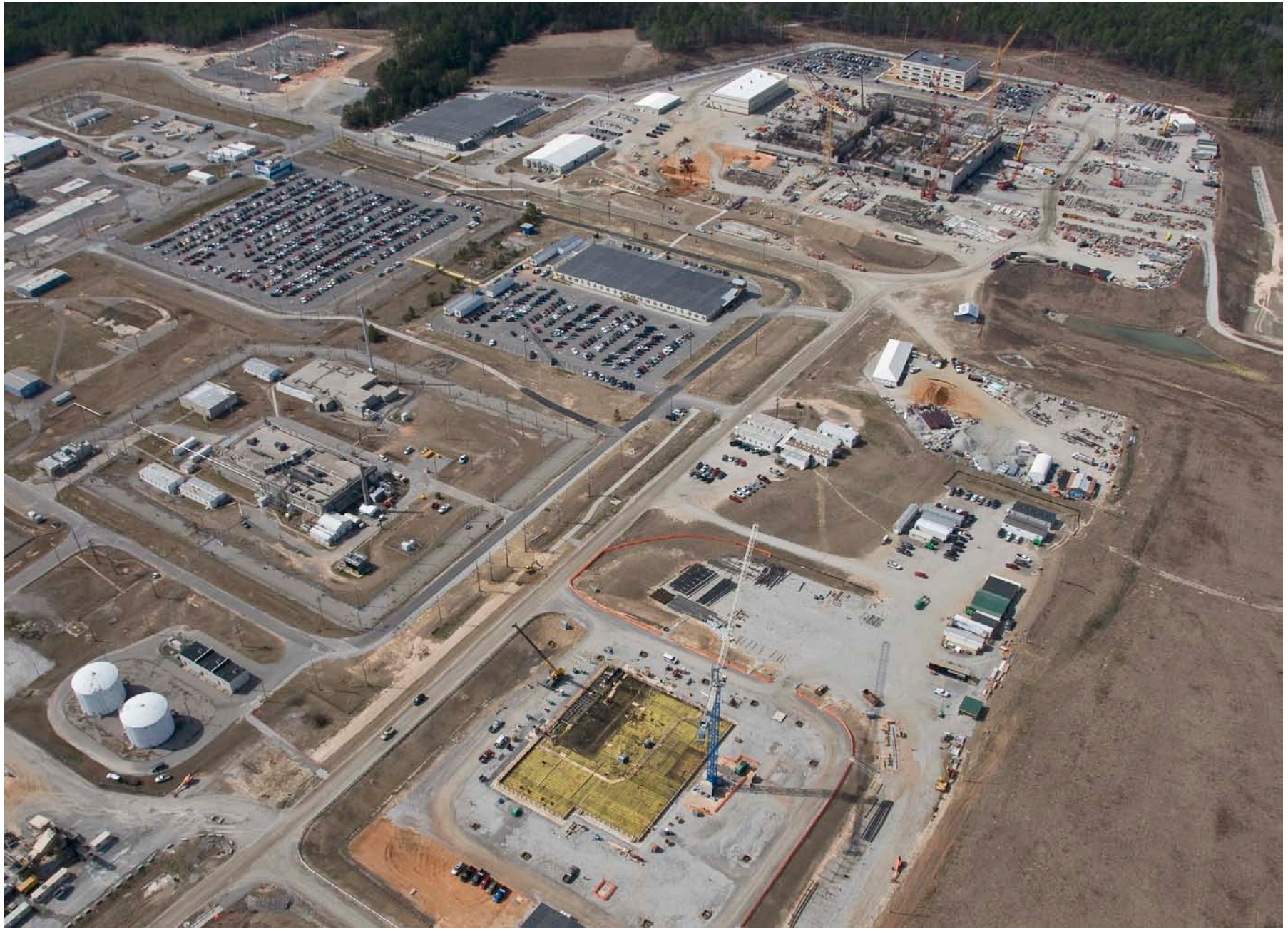
MOX/WSB Construction Site March 2010