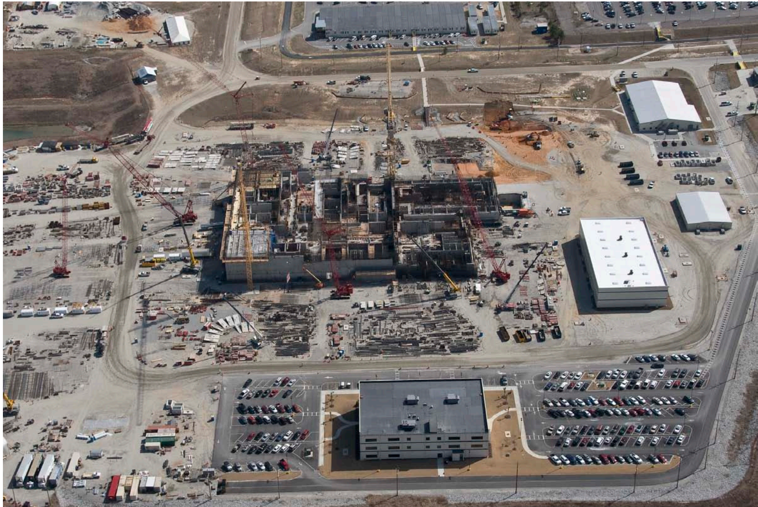
MOX Construction Site March 2010