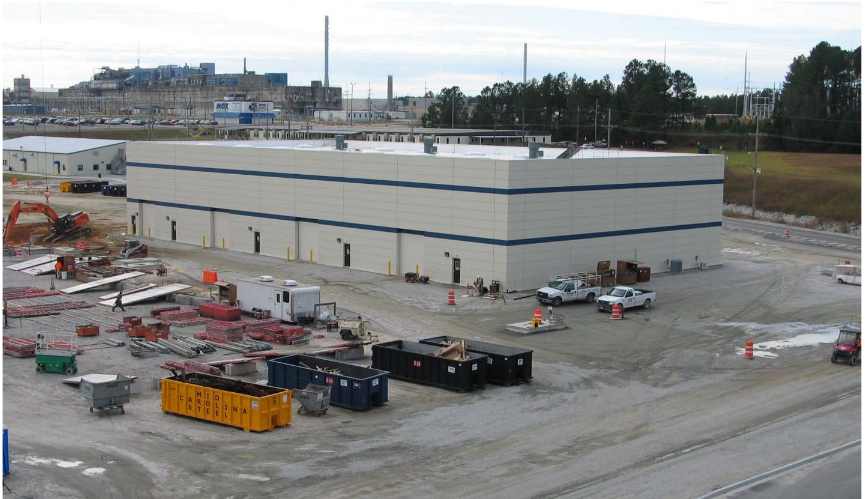
MFFF Secure Warehouse