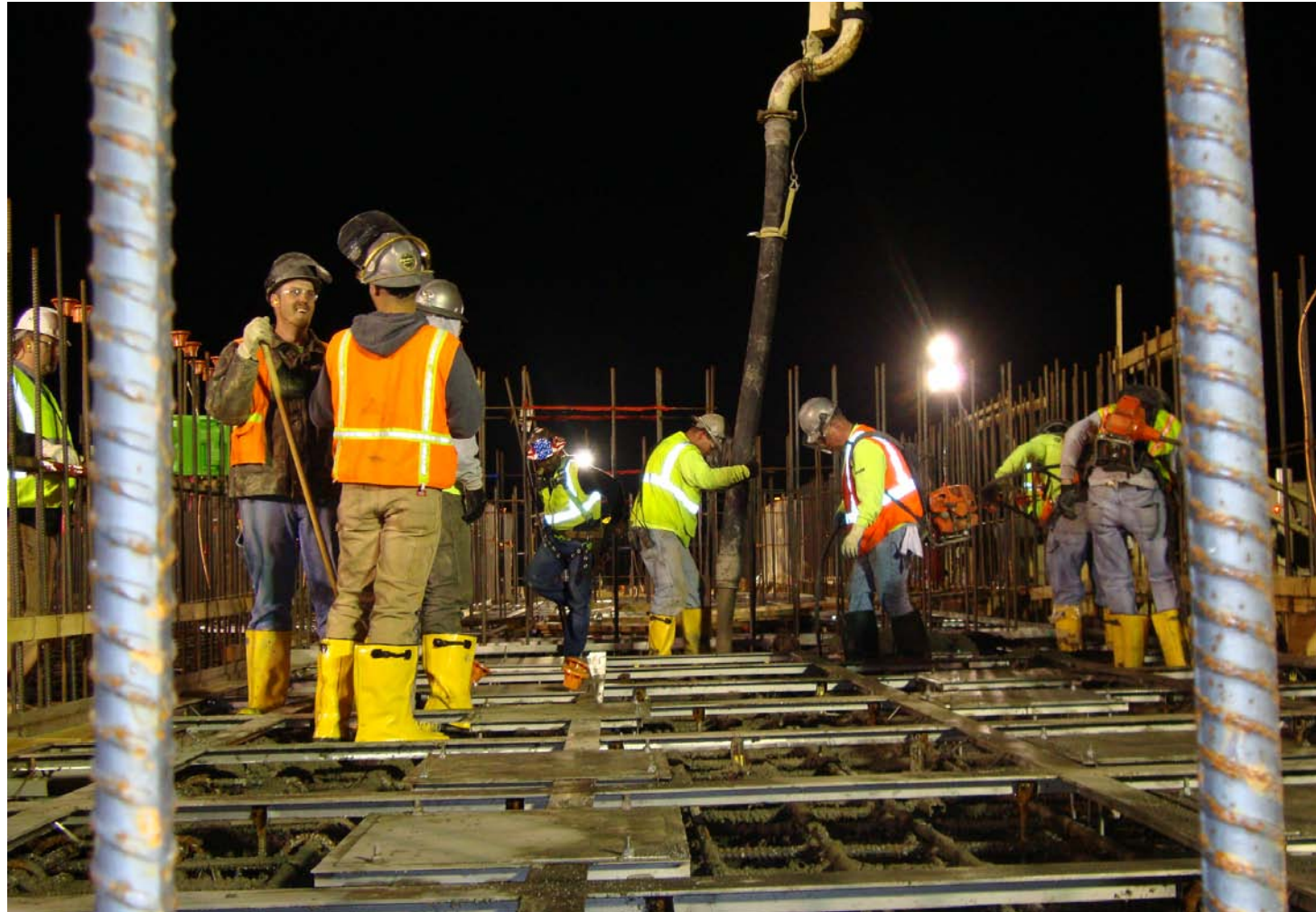
First Basemat Placement