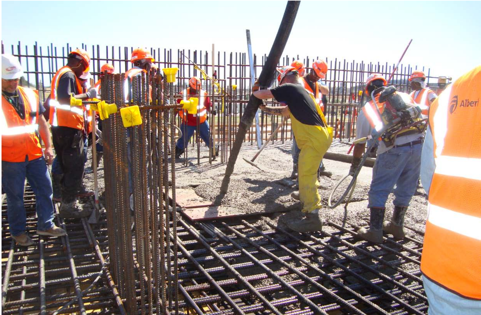
Concrete Placement in Fuel Manufacturing