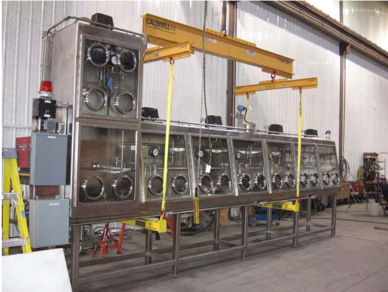
Process Glovebox at Vendor