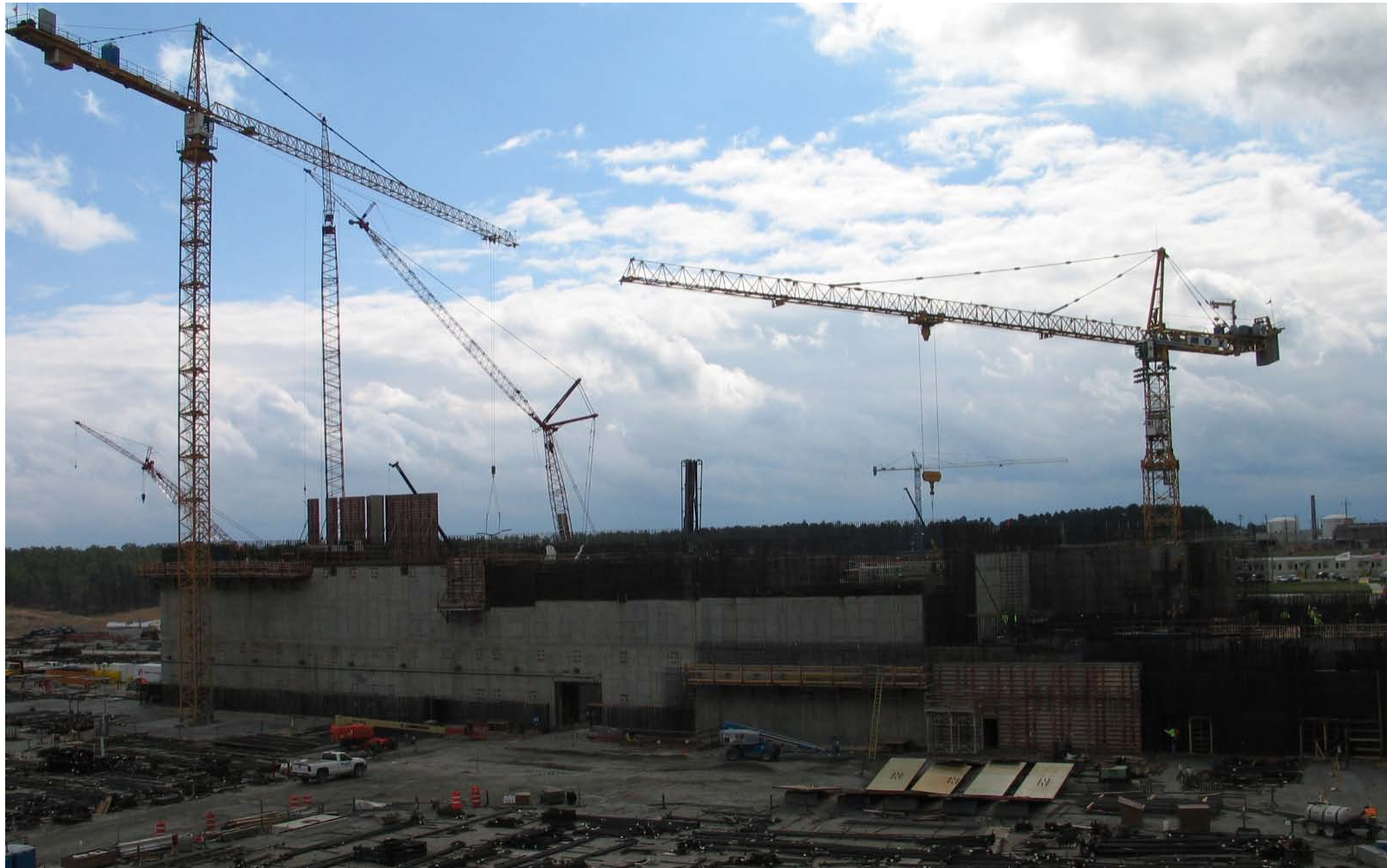
MFFF Looking South East - March 2010