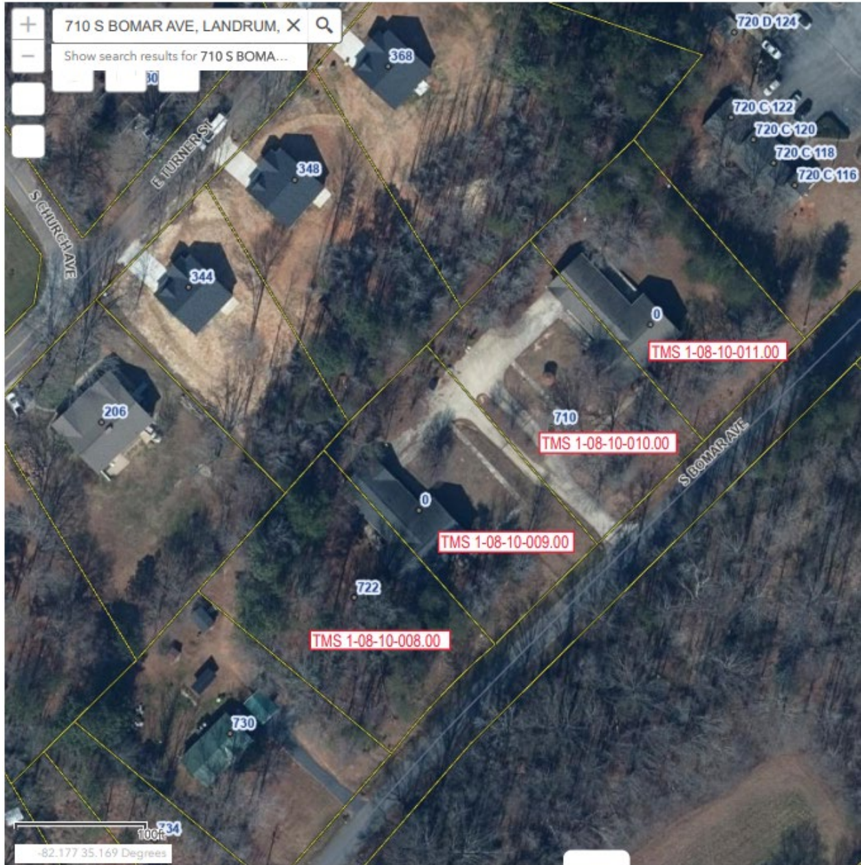
EXHIBIT A LOCATION MAP (cont'd.)

Issue Date: 2/9/2024 Opening Date: 3/14/2024