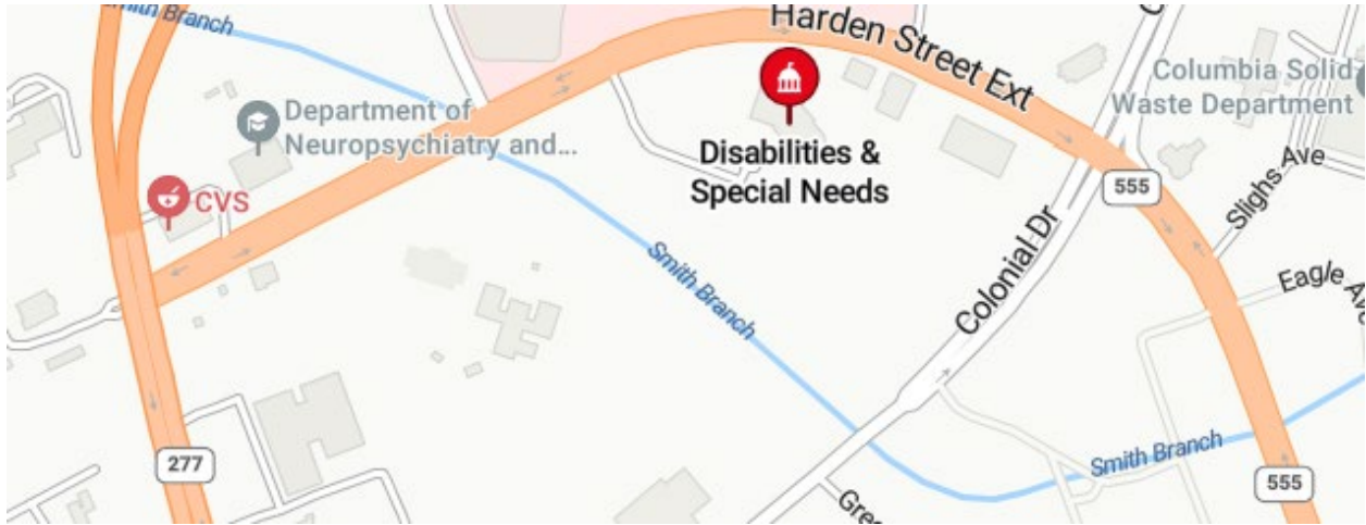
EXHIBIT C PROPERTY INFORMATION – 3440 Harden Street Ext. (Location Map/Photo/Floor Plans/Plat

Issue Date:11/12/2024 Opening Date:1/27/2025