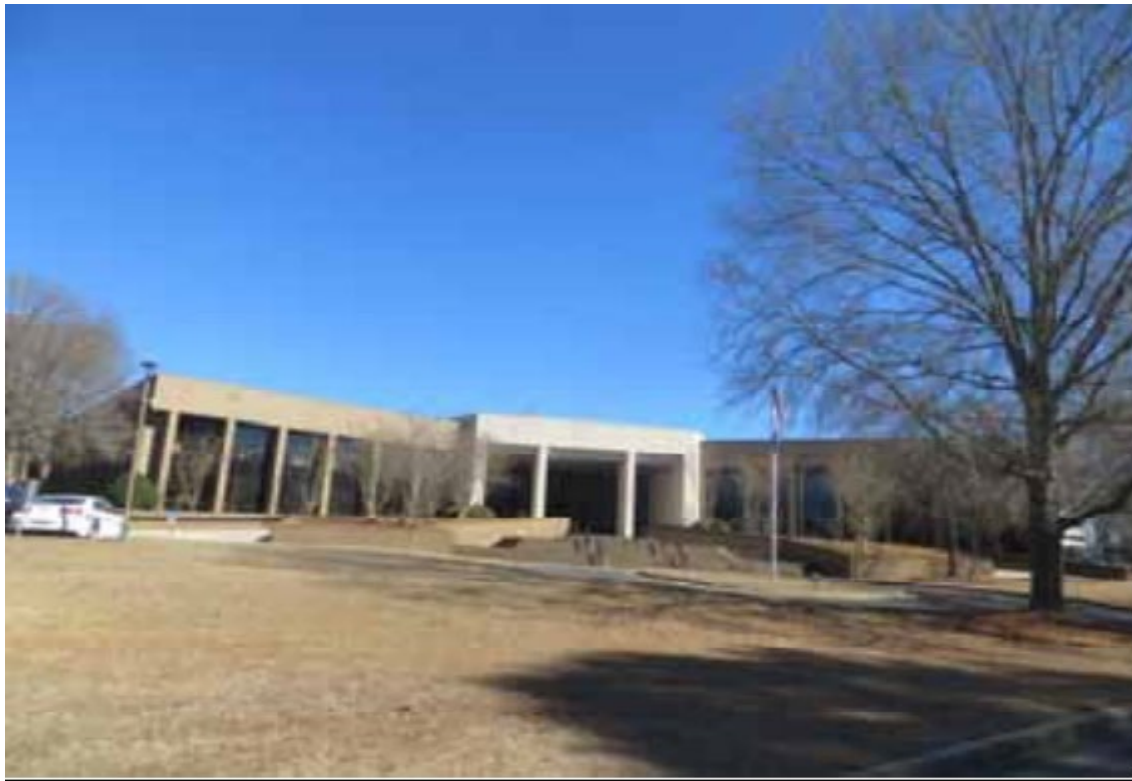
FRONT VIEW OF SUBJECT